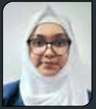
AFNAAZ - 12H

were told, "When we tried raising capital, we were told that digital-first beauty will be a small market and that it would be impossible to compete with large FMCG companies without raising hundreds of millions of dollars. We were even told that the product itself won't be a strong moat since it is a commodity."