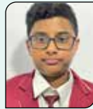
AEBIN 10G - JAN 5