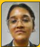
NAVAL - 11G