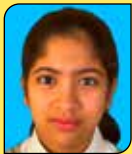
REESEMARY - 8A