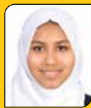
MAHASIN - 11I