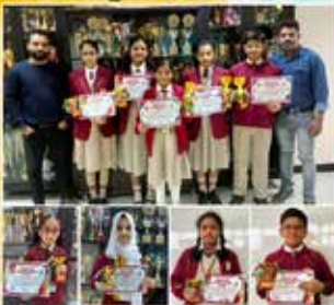
Winners of the painting competition Niram 2023 conducted by Kala (Art) Kuwait on the occasion of Children's Day