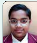
ADIN 10G - JAN 31