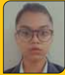
USHASHRI - 12M