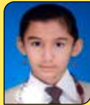
ENAMRUTHA - 9A