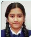
ONEGA WILLIAM 11B - JAN 25